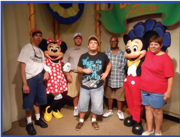
Whispering Oaks Residents enjoying their trip to Disney, June 2010

THANK YOU FOR SENDING A GENEROUS DONATION TO-DAY! A copy of the official registration and financial information may be obtained from the Division of Consumer Services by calling toll free within the State call 1-800-435-7352. Living Inclusively for Everyone, Inc. (LIFE) is a corporation registered as a public charity under section 501 (c)(3) of the IRS Code.