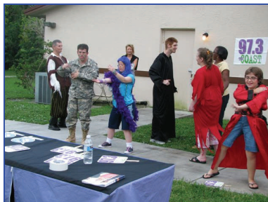
Halloween BBQ 2008